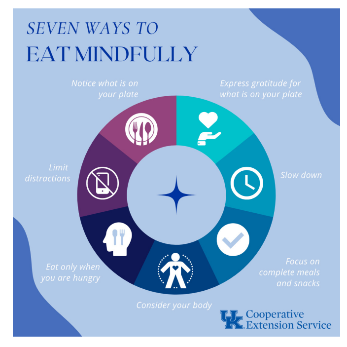
Figure 2. How to eat mindfully.

Incorporate a variety of foods that include protein, carbohydrates, and fats. Each macronutrient has a different purpose in your body and when you consume a mixture of the three, you are best able to nourish yourself. Start with smaller portions. You can always get more.