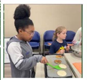
4-H Cooking Series