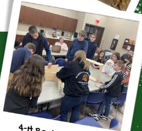
4-H Beekeeping Club