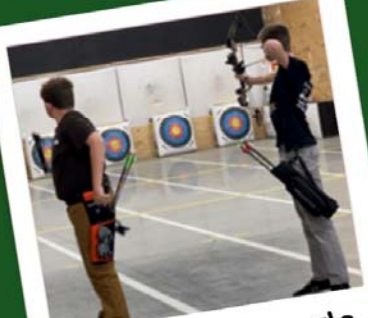
4-H Shooting Sports