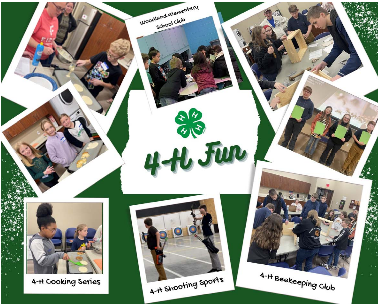
Woodland Elementary School Club